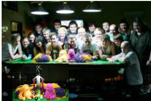
Miss Q's Challenge Team Champions Do Us Proud!

Sunday 28 th of August saw the Gosnells Challenge Team travel to Miss Q's bringing the trophy they had held in their possession for two and a half years worth of Challenge Matches (10 Straight wins) only to find themselves leaving here at Miss Q's (It's only rightful home). Miss Q's had held it's traditional team qualifier the previous Saturday and was left wanting when we found many of our strongest players had been unable to attend and consequently didn't make the team, nevertheless the competition was still solid during the qualifier & we still had a strong side with