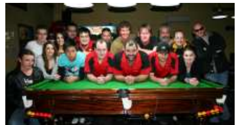
Gossies Team Challengers

P.s That was the easy bit guys keeping that trophy for another 10 straight wins is gonna be the tough part. Thanks all, Az.