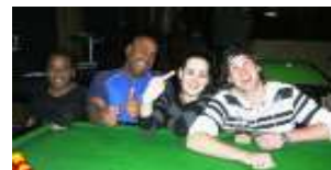
Sunday Red Team Champs "Nut Flush" with Runners Up "Flying High"