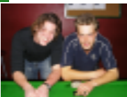
Wednesday Red Team Champs "Sadim 2" with Runners Up "A Man & His Chook"