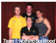
Team 1: Nothing But Wood

Hey, hey it's the best team in the comp, well the name says it all "Nothing But wood, and spoon that is...."