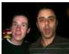
Could they look any worse? Garlic I swear to God you are retarded