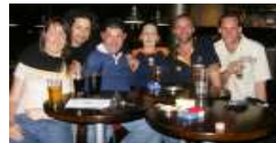
A mixture of Wednesday Night Party Animals;

I keep telling you people to stay late on a Wednesday Night. We had drinking, smoking, singing, spanking and nudity.