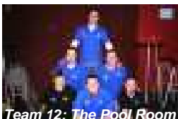
Team 12: The Pool Room

Gee, what an original name... how did we ever come up with that!!