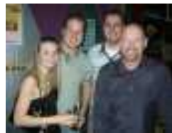
And the award for worst photo ever...