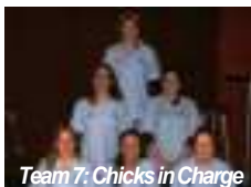
Team 7: Chicks in Charge

Chicks In Charge..... mmm girly Team. "If you girls all rock up dressed in leather we promise to throw all our games!"