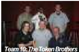
Team 10: The Token Brothers