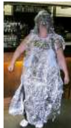
(L) Al Foil, Ange!