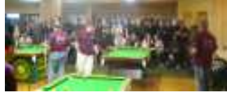
The PPI gang....