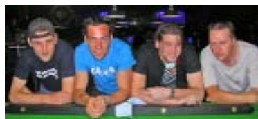
Above: Sunday Green Team Champs "Bukkake" with Runners Up "Papier & Crackers"