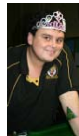
Bulldog the Aussie made Princess