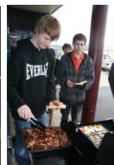
Challenge Day Breakfast