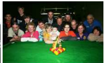
The most successful Miss Q's Geraldton Challenge Team yet!